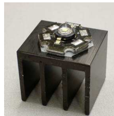
SK452 with --> 3 Watt Luxeon LED