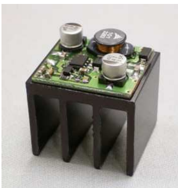
← SK452 with HKO1000